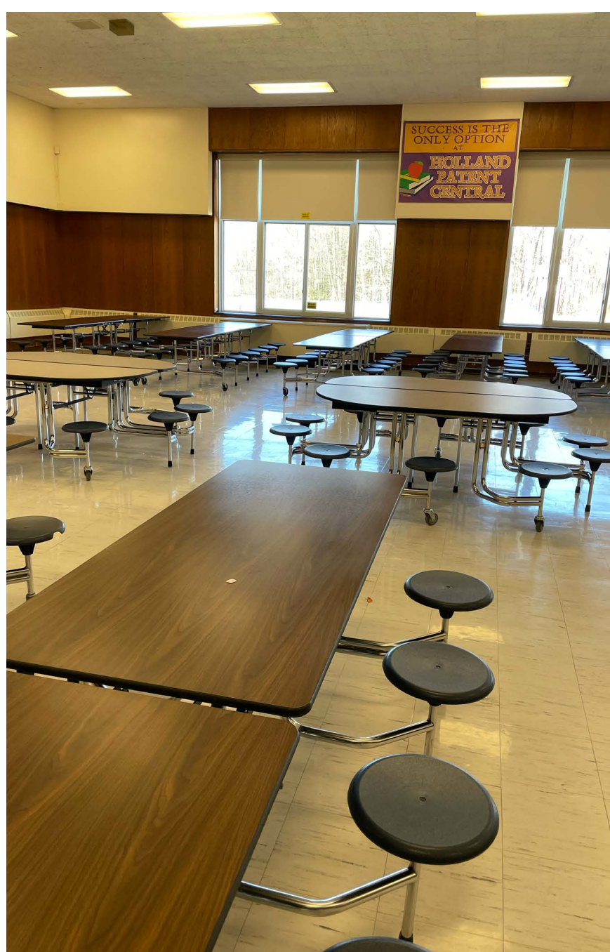
Original High School Cafeteria