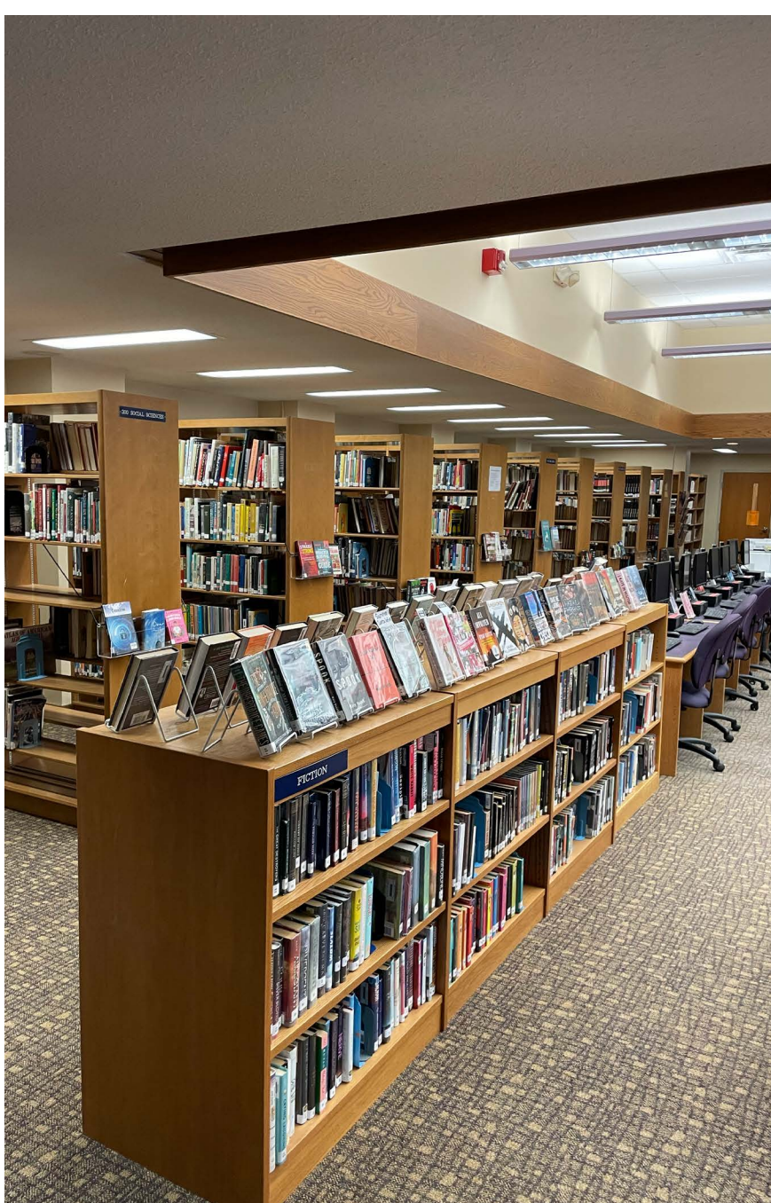
High School Library