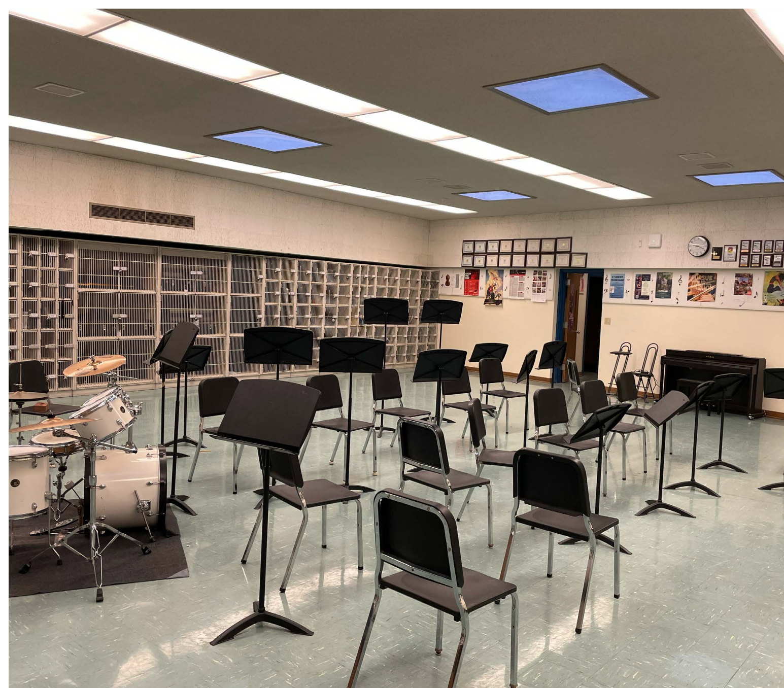
Original High School Band Room